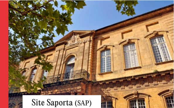
Site Saporta (SAP)

Sciences Po Aix is located at 25 rue Gaston de Saporta in Aix en Provence. The school is made up of 3 buildings: