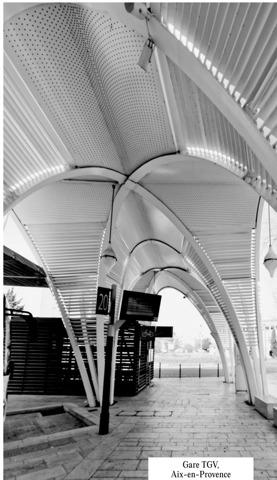
Gare TGV, Aix-en-Provence