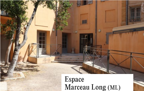
Espace Marceau Long (ML) 21 rue des guerriers