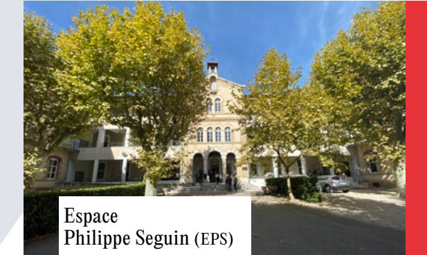
Espace Philippe Seguin (EPS)