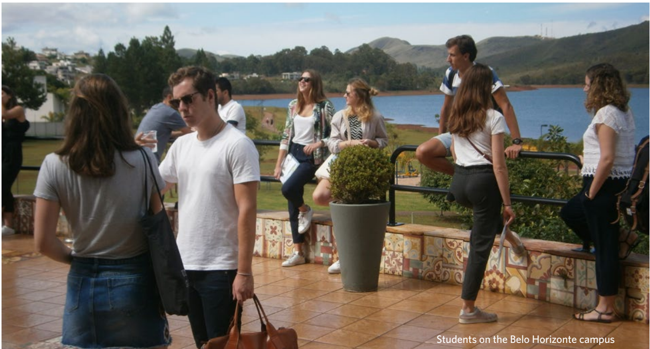
Students on the Belo Horizonte campus

are registered marks of the IPMA in Switzerland and other countries.